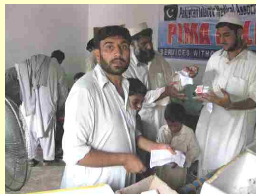
Pharmacy busy in dispensing medicines at a camp in Layyah