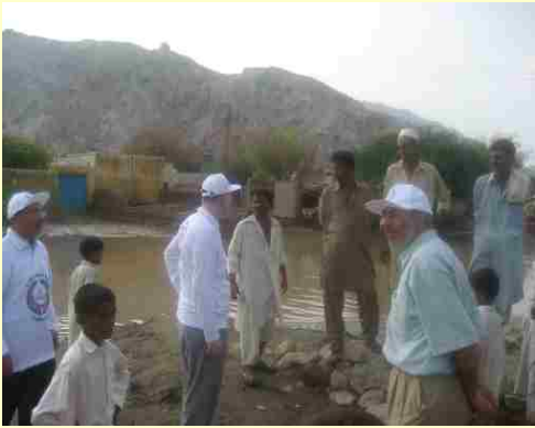
Team of AMU doctors after crossing the Indus River