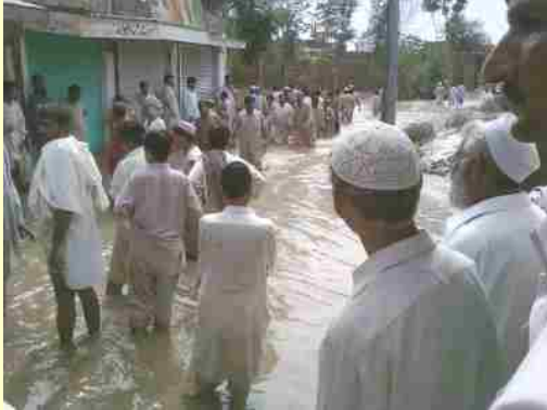
Patients waiting outside for their turn at a PIMA clinic in Peshawar