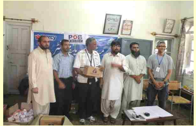
POB team delivering donations of eye drops to a Medical Camp in Charsadha

The IMANA team recommended that the President declare a national disaster and consider implementing a central emergency command structure under the military. This central command would then direct all relief efforts (governmental and civilian-NGO) and would establish similar command posts within each individual province. The President noted the recommendations and was extremely grateful to the individual volunteers of