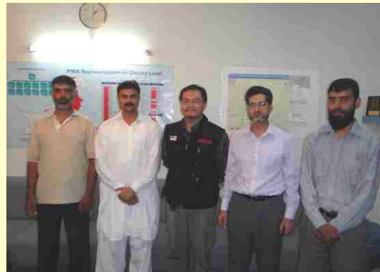
PIMA Medical team with Doctors from Malaysia