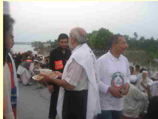
The AMU doctors having their Aftar Dinner in camp of displaced flood victims